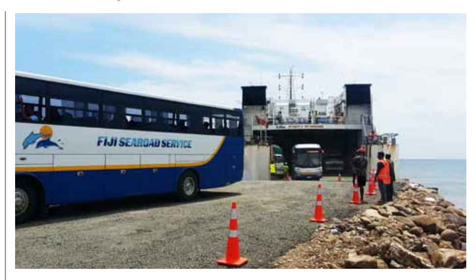
The Nabouwalu Jetty and surrounding areas can expect a hive of activity once the satellite town is established.

A series of consultations had been jointly conducted by the Town & Country Planning,