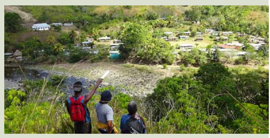
Draubuta Village is likely to benefit from the community driven REDD+ programme.

With most of Fiji's land mass being covered by thousands of acres of forest land that are virtually inaccessible, landowners may have a way to benefit from REDD+.