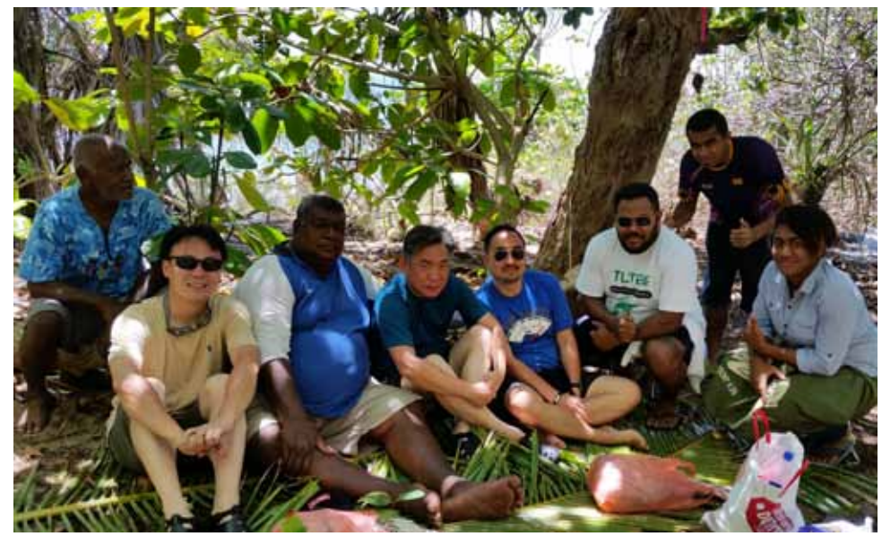
Pictured here are landowners and TLTB staff with the new owners of Kadomo.

TLTB's Tourism Department is located in Nadi and Suva.