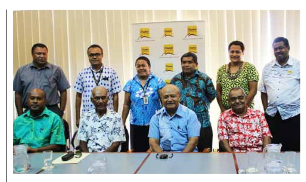
Senior managers from TLTB, SIT and the MInistry of Sugar are pictured here following the MOU signing in Suva.

The computerised Sugar GIS Mapping Data System is a computer based digital graphic index of Fiji's land boundaries that attribute data. Attribute data is information linked to the graphic framework of the Sugar GIS Info including lot numbers, plan numbers, areas, land names, road names, and farm boundaries.