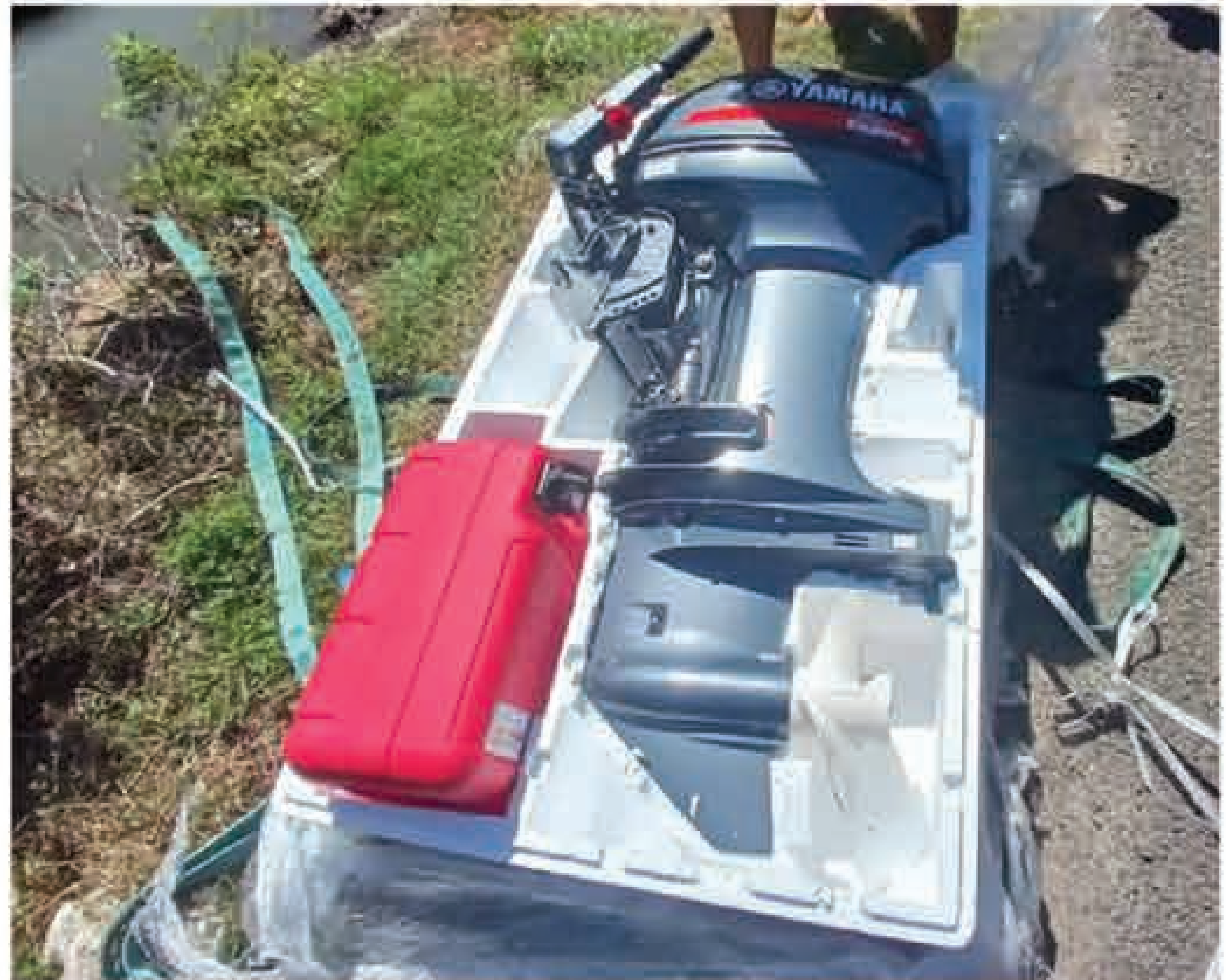
Full gear for fishing and tourism activities at Sanasana Village