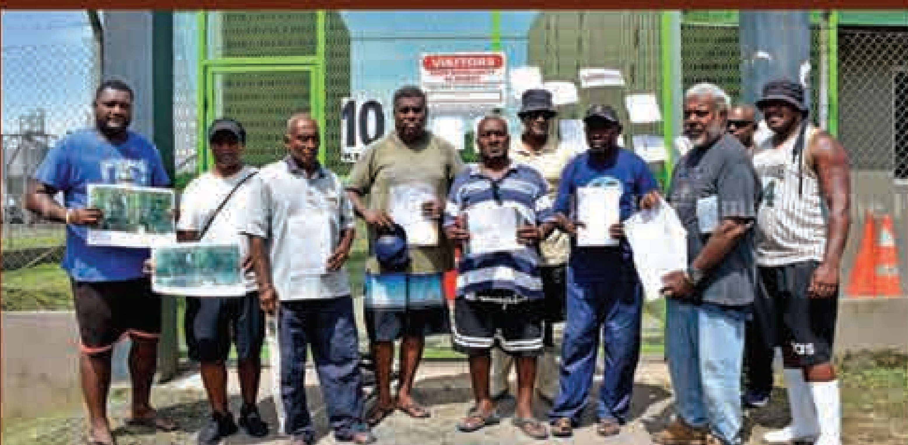
LOU protest at the GFIL lease at Vunivaivai is a mistake by them

In 2011, Mataqali Vico with Mataqali Namara filed legal proceedings in the High Court challenging the