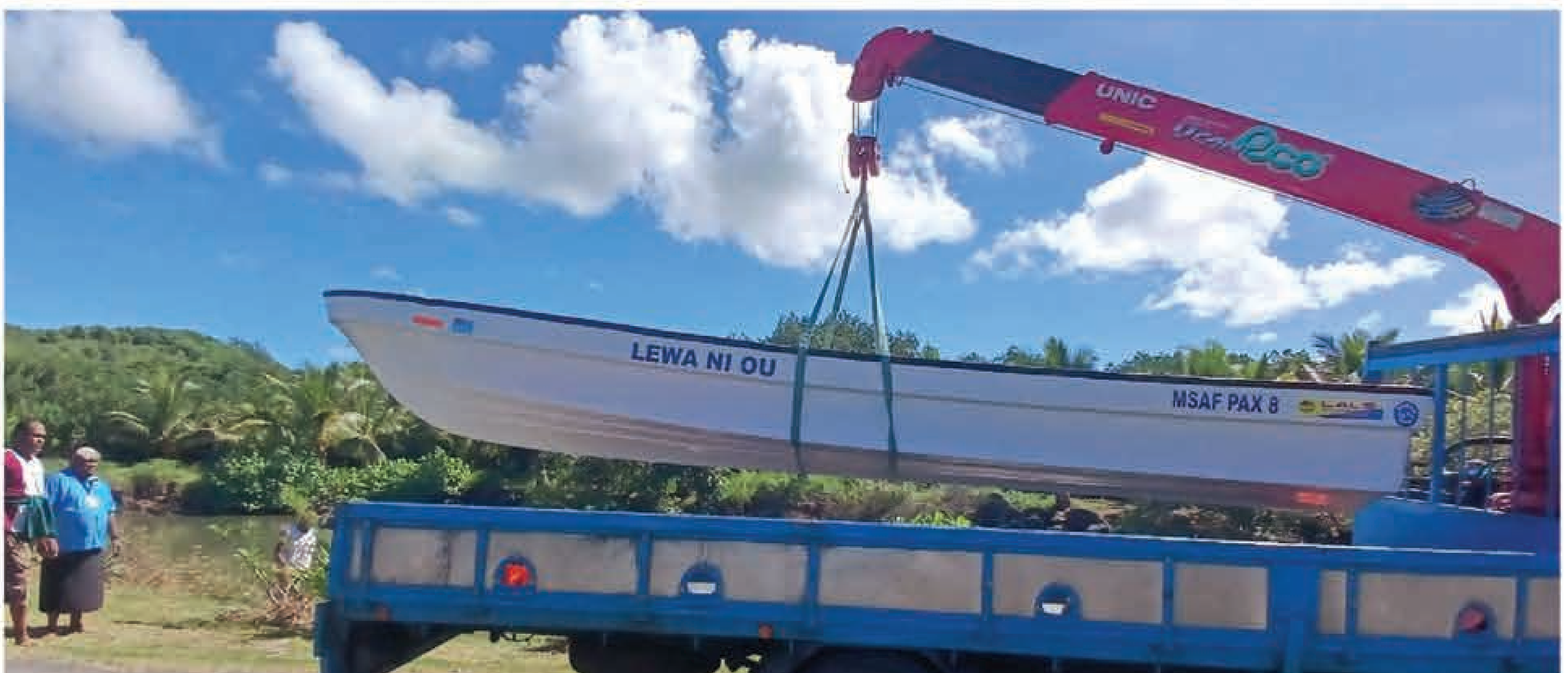
Lease funds fully utilised for purchase of this 23-foot fibreglass boat

This investment will enhance sustainability, create new revenue opportunities, and contribute positively to economic growth in