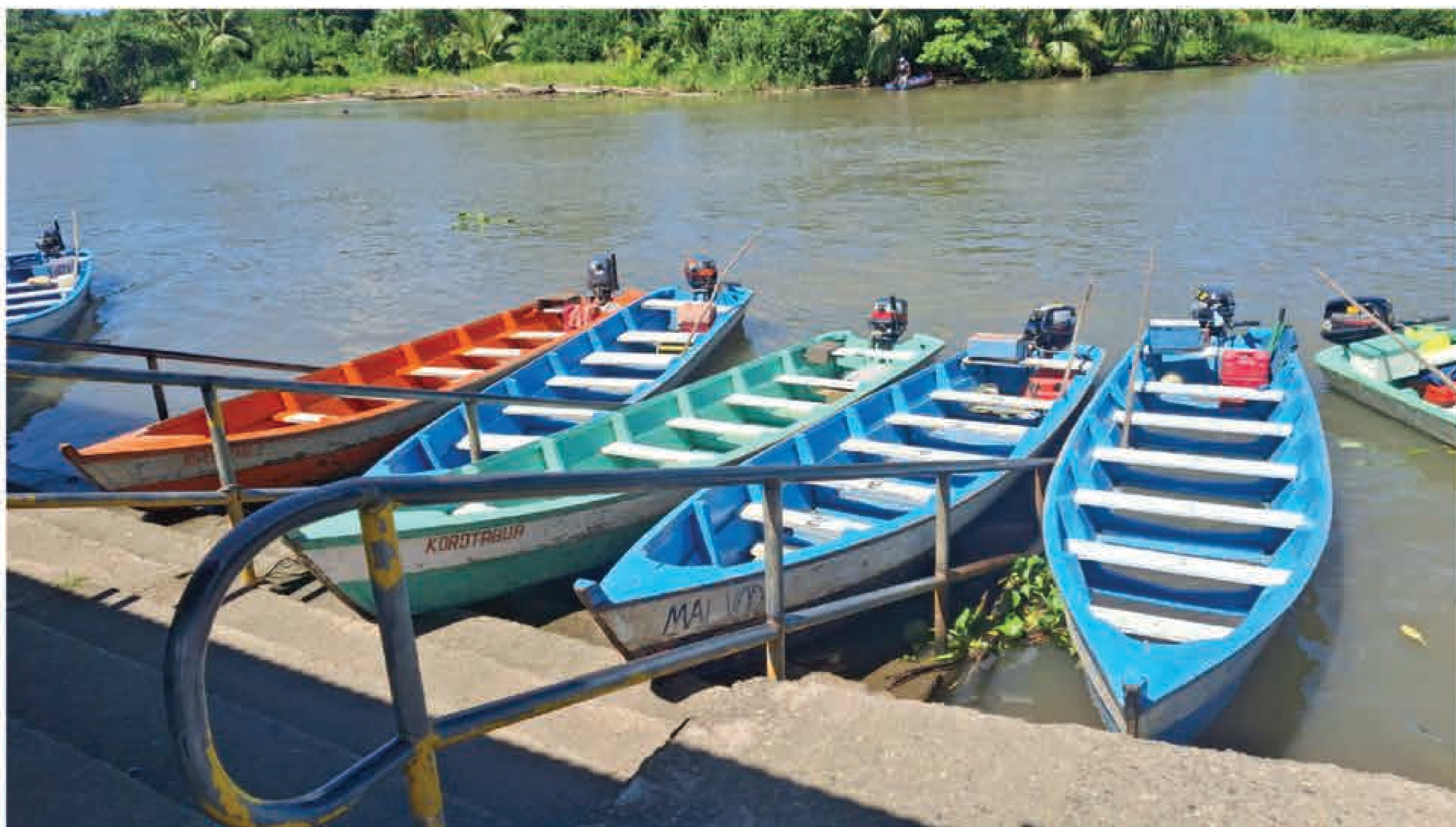
Water Taxi is a well-known business initiative in the delta areas of Rewa; an opportunity for TDFP assistance