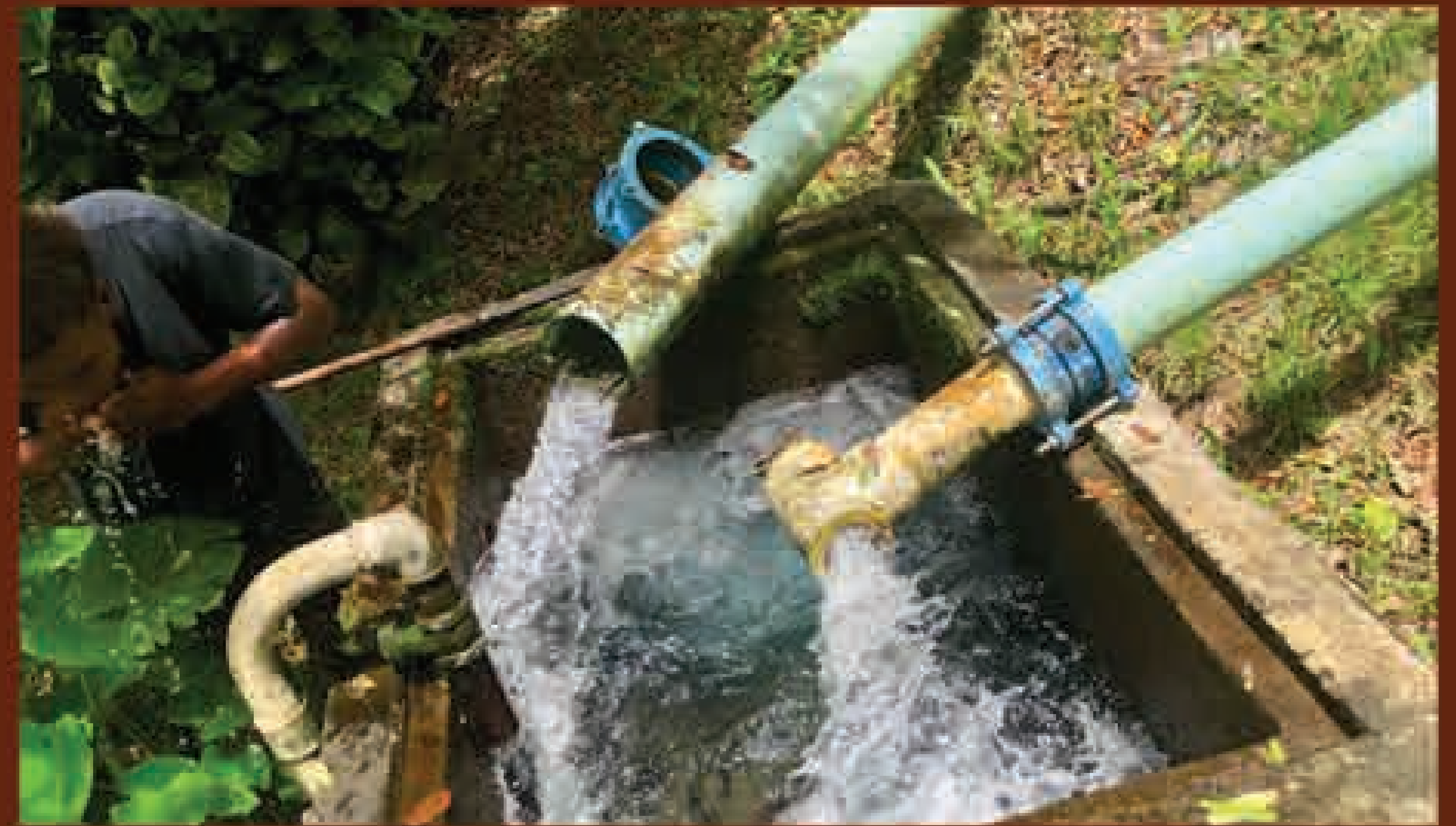
Nasarava Water Catchment