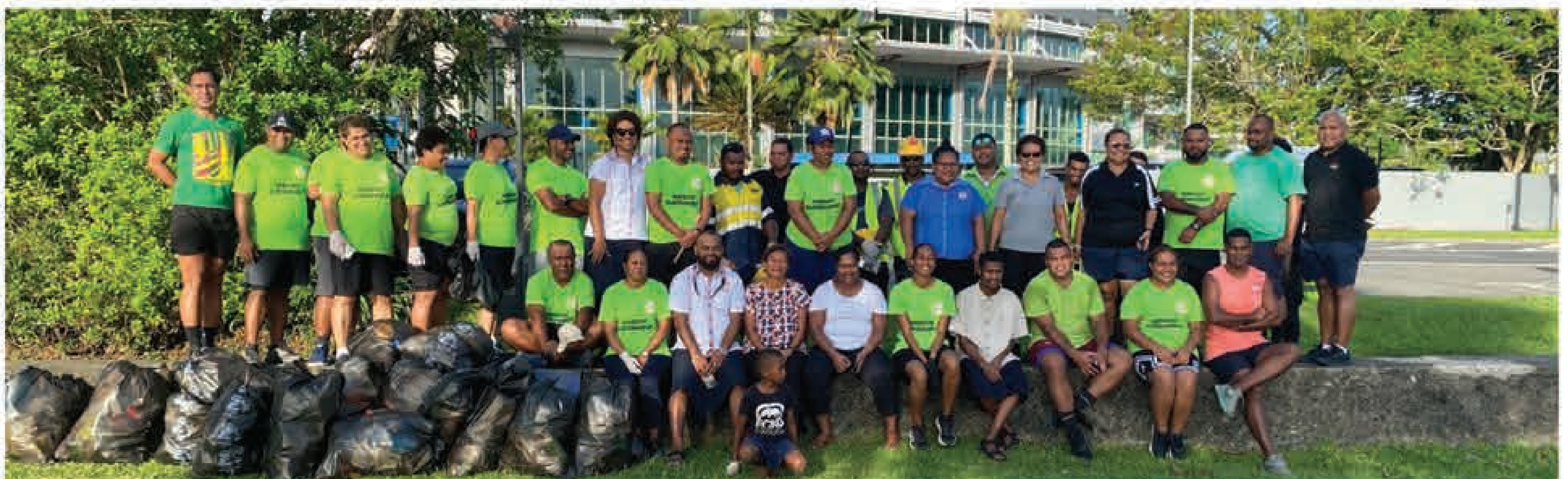
TLTB staff always happy to give back to the community and cleaning up our surrounding environment

Their collective efforts contributed to improving the cleanliness and preservation of the shoreline, highlighting the importance of collaboration in maintaining a healthy environment. The initiative reinforces TLTB's role in promoting sustainable practices within the community. ■