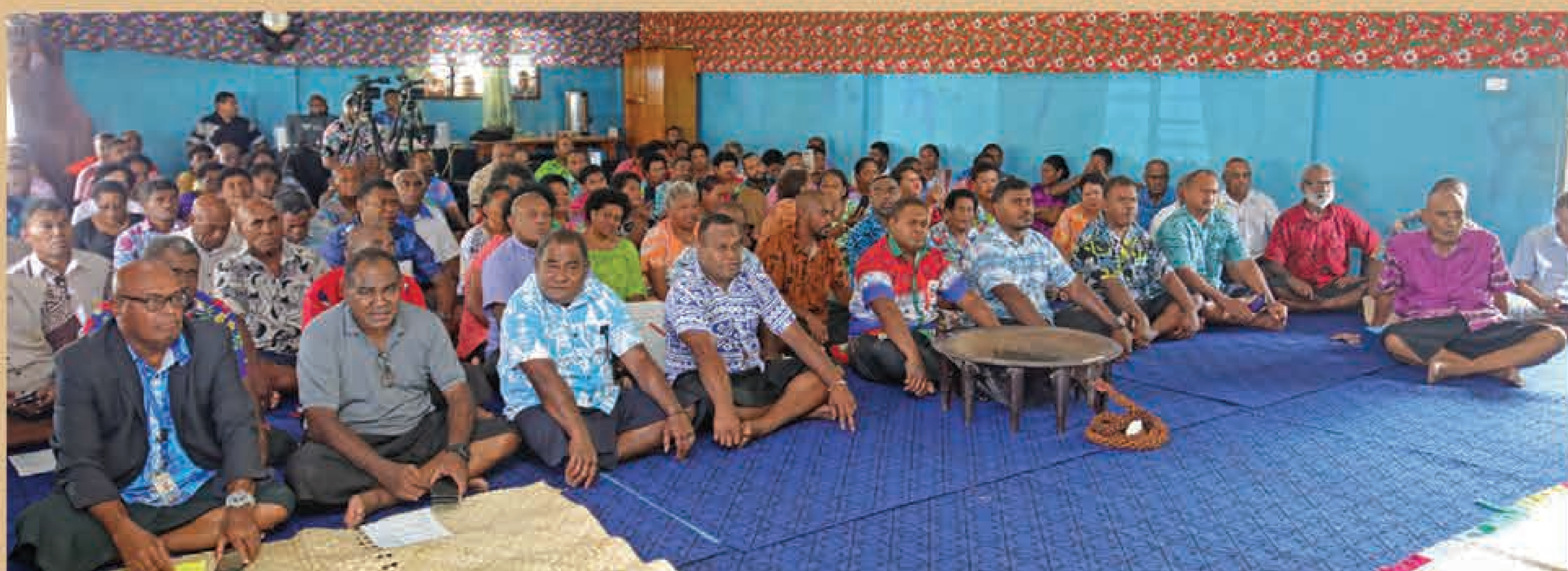
Landowners of Vitogo gathered at Vitogo village for the successful reversion of their land back to them (from State Land to iTaukei Land)

The ceremony, held at Vitogo Village this week, were also attended by the Momo na Tui Vitogo Ratu Jone Sovasova, Minister for Lands & Mineral Resources Hon. Filimoni Vosarogo, Minister for Youth & Sports Hon. Jese Saukuru, CEO Mr Solomone Nata, Chairman of the Ba Provincial Council Ratu Meli Tora Tavaiqia, Acting Commissioner for the iTaukei Lands and Fisheries Commission (TLFC) Mr Kelepi Curuki and Reserves Commissioner Mr Mosese Ratubalavu. ■