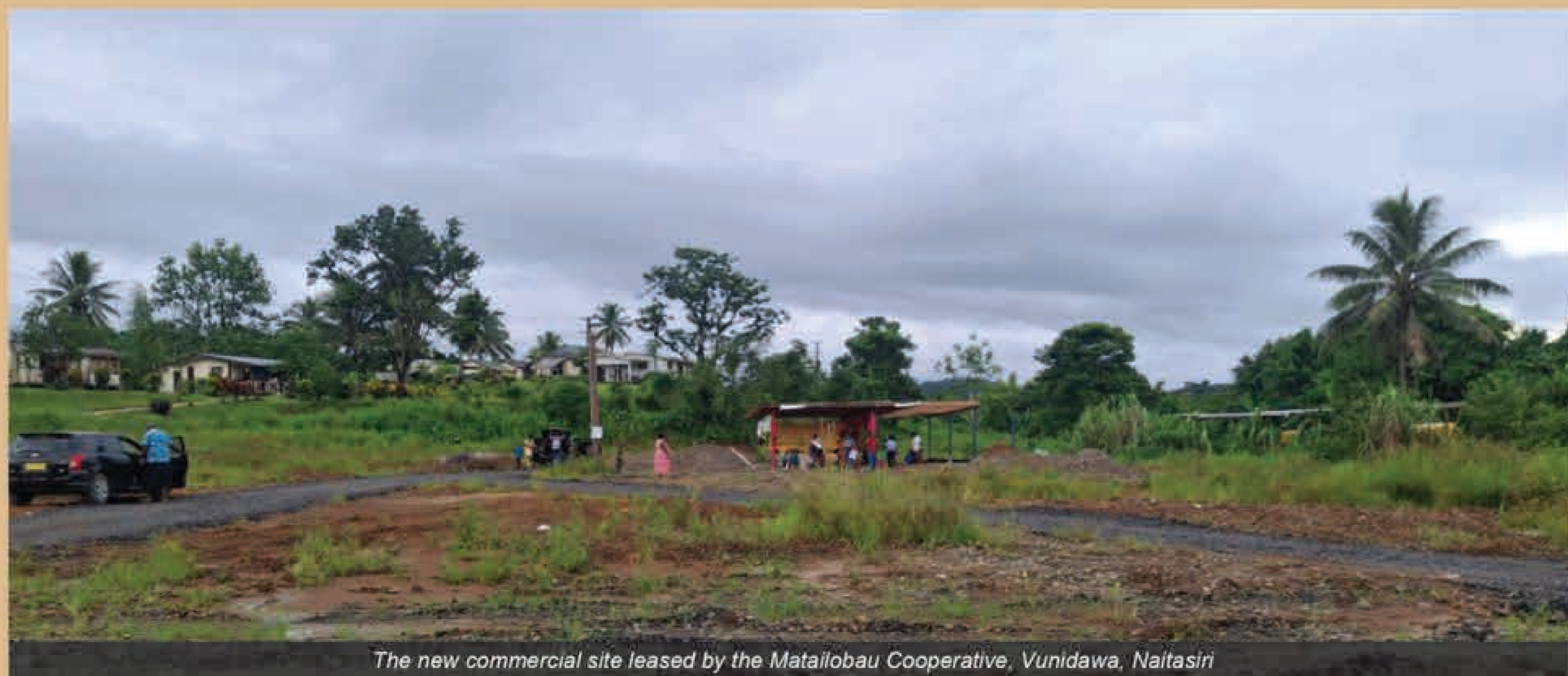
The new commercial site leased by the Matailobau Cooperative, Vunidawa, Naitasiri

And also build institutional capacity by equipping Matailobau Co operative and the LOU members with enhanced skills, governance structures, and operational systems required to effectively manage and sustain commercial operations as such. ■